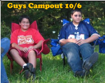
Guy's Campout 10/6